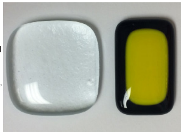
Test tiles fired in the kiln with the DT25 Green Man Texture.